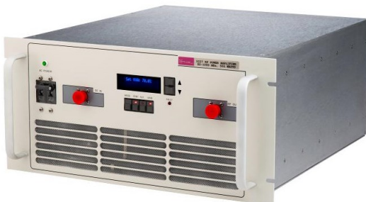
FE Model Shown

Specifications subject to change without notice.